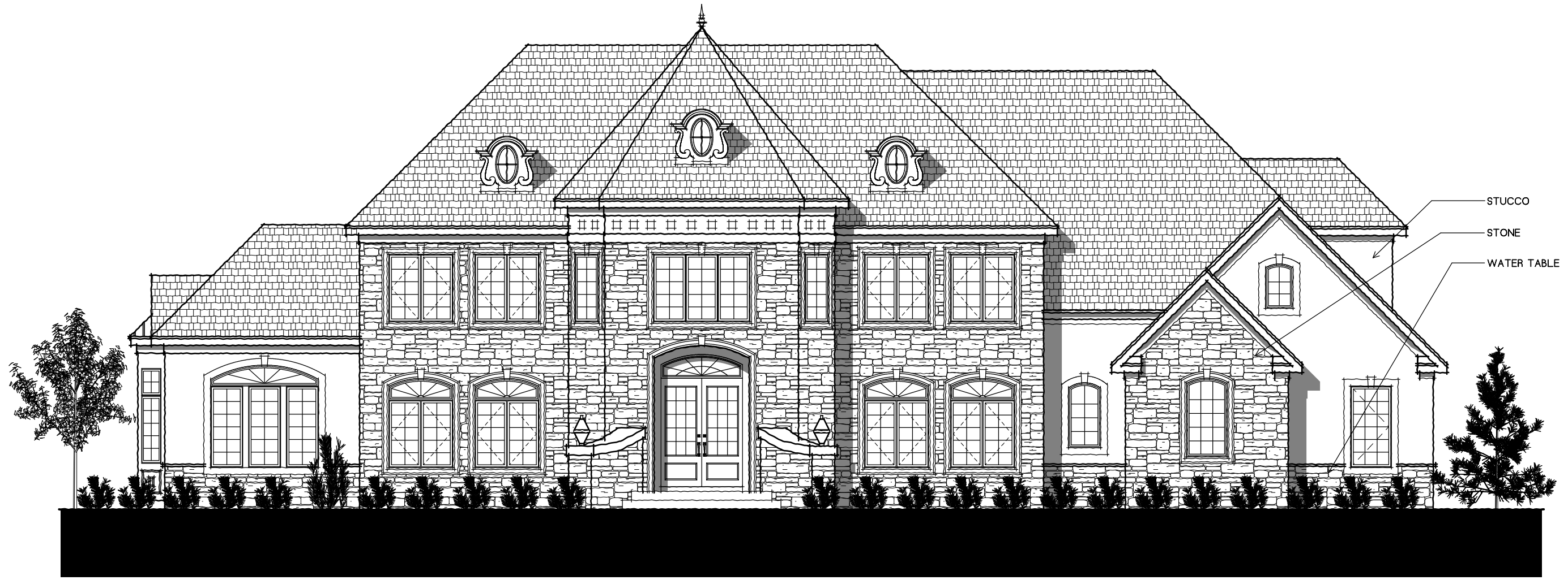
Elevation 1 Scale: 1/8"=1'-0"

Note: All dimensions are approximate and subject to change without notice.